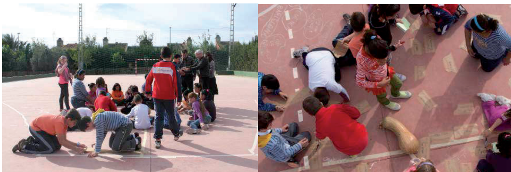
Game „ mapa colectivo entorno al cole“ class 5°, School Hernandez Ardieta , in Roldan, Murcia euler&lucas Corridor Breaks, Manifesta 8