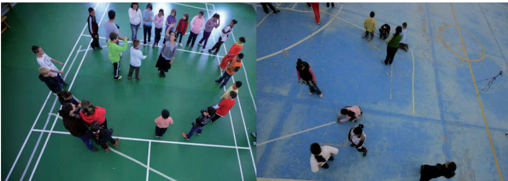
„la maquina colectiva“ class 4° and 5° Infanta Le- onor School of Mazarrón, euler&lucas Corridor Breaks, Manifesta 8