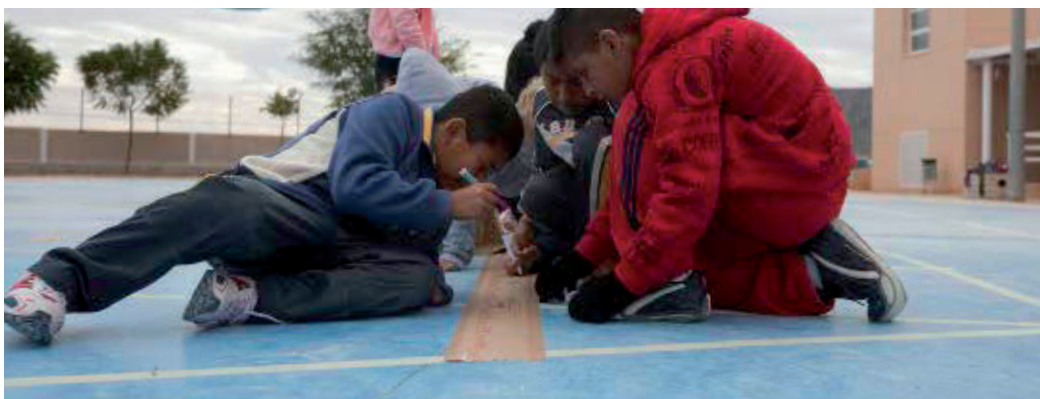
Game „ mapa colectivo entorno al cole“ class 4° & 5°, School Infanta Leonor in Mazarrón, Murcia euler&lucas Corridor Breaks, Manifesta 8